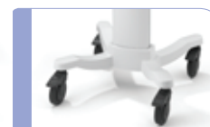
Model Shown here with hospital-grade wheel option

Accessory Choices: AHA, IEC, reusable/disposable electrodes