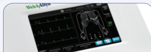
LEAD QUALITY DISPLAY

No need to track between the display and keyboard, helping you to save time and reduce errors.