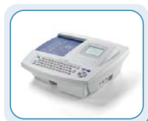
Welch Allyn CP 100™ Transfer information via SD card