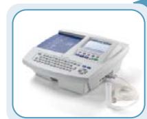
Welch Allyn CP 200™ Transfer information via direct connection or SD card